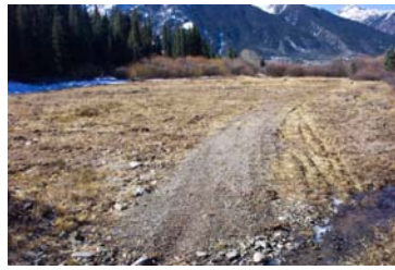
Lackawanna wetland trail improvements were approved for construction by Army Corp of Engineers for 2009

Endorsed by San Juan County Commissioners, Town of Silverton Board of Trustees & Silverton/San Juan Co. Planning Commission