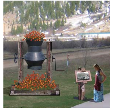
Conceptual Illustration of the art piece

the landscape shapes their lives. In this case, it's the connection between the railroads, the minerals, mountains, and the people who worked these lands, a poetic metaphor that invites questions more than supplies answers. All donated by DSNGRR, its made of rusty metal cranks, railroad ties, and a steam engine stack—originally fabricated for western movies shot in Silverton—invoking the original machines and processes of railroads and mining, but the workings here are symbolic of a new relationship. His artwork will be installed during in July of 2009. See more of Shan's work at www.shanwells.com .