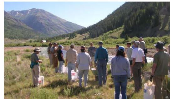
2006 Animas River Festival & Cleanup

engagement process, implementation of specific projects, and planning. Alpine Environmental conducted the Preliminary Environmental Assessment and provides environmental services, and San Juan County Historical Society provides historical guidance and information. San Juan County residents have donated hundreds of hours as volunteers to the project.