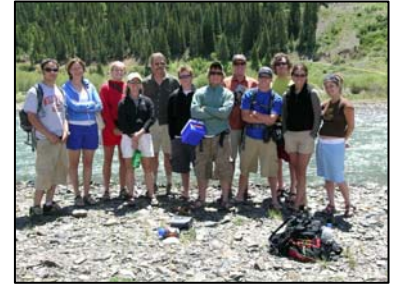
The Value of Place class field-trip.

Fort Lewis College Funding for Field-Based Education A FLC-MSI partnership provides opportunities for FLC classes to stay at the Avon and also for students' mountain research projects. Winners of the 2007 FLC-MSI Mountain Mini-Grants will be notified soon. Faculty proposals for summer and fall field trips to Silverton are due April 27. Please visit www.mountainstudies.org/Research/opportunities.asp .