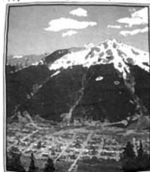
Science for Sustainability Silverton, Colorado