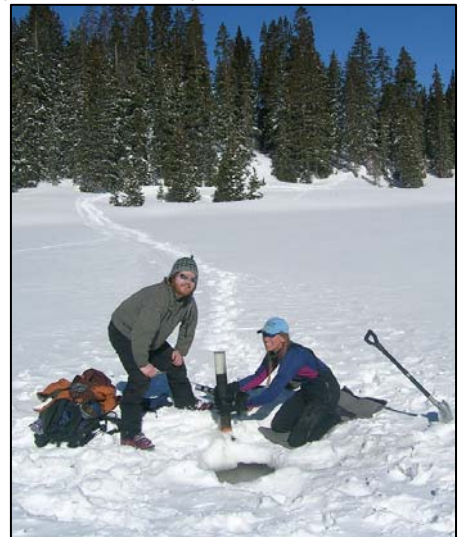
A sediment core from Crater Lake, April '07.