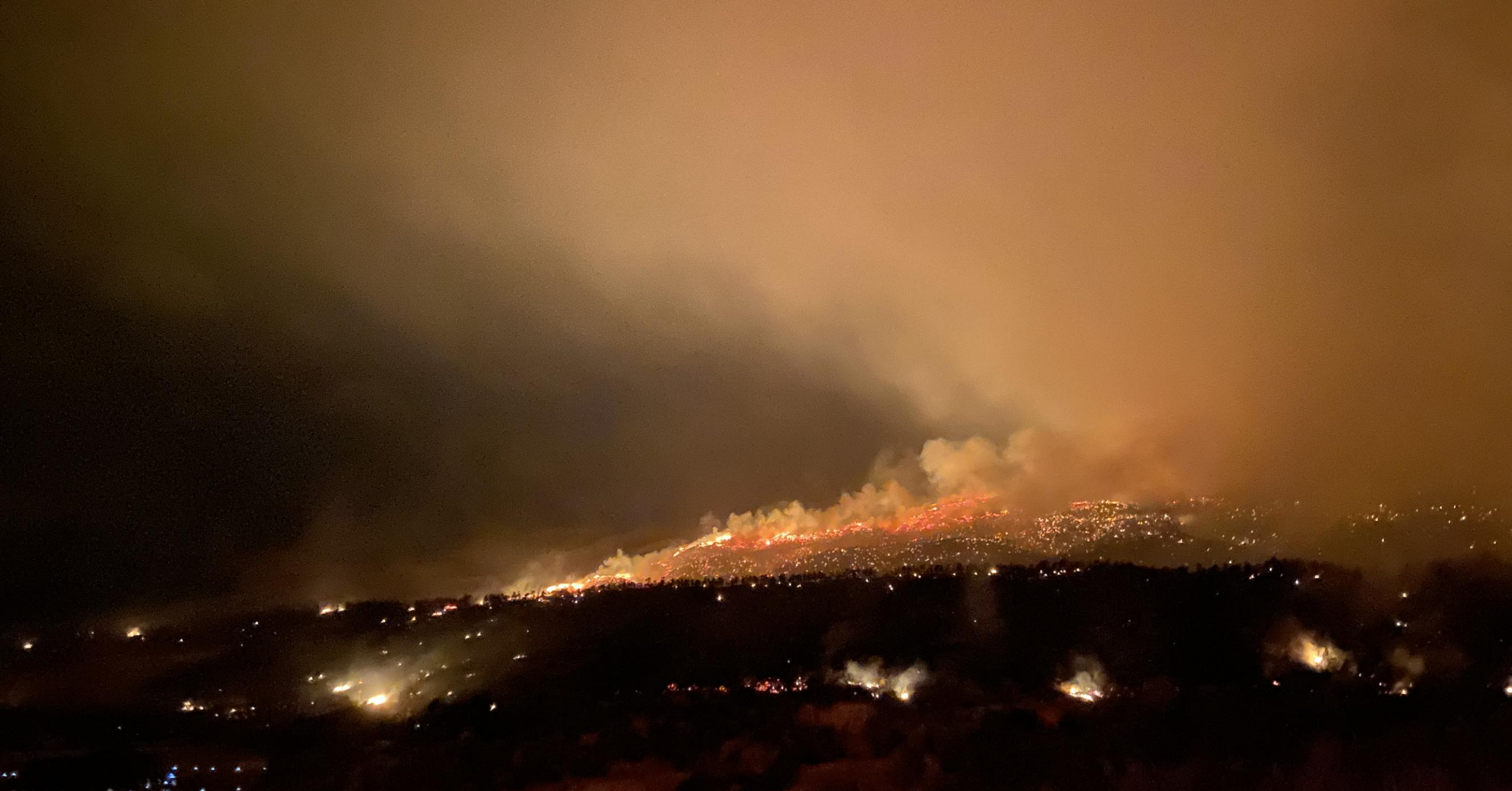
Cameron Peak fire, Colorado (2020).