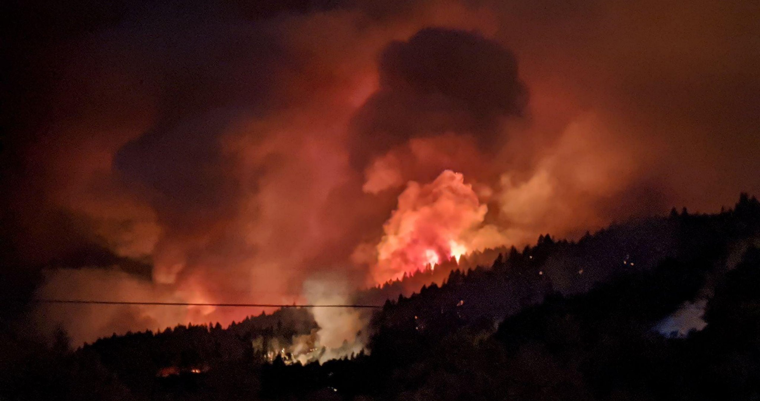
Slater Fire in Happy Camp, CA (2020).